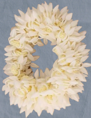
Faux Mogra Scrunchie Plastic