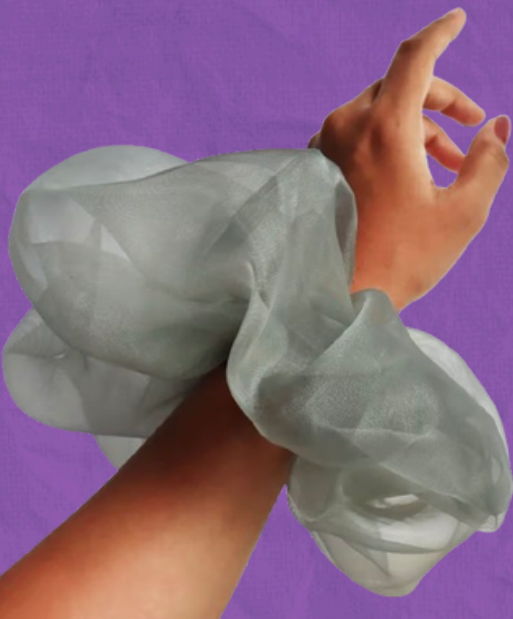
Sheer Scrunchie Organza / Tissue