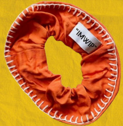
Embroidered Scrunchie Blanket Stitch on Cotton