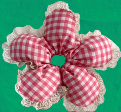
Pillow Scrunchie Gingham & Lace