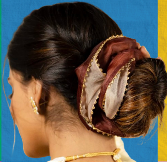
Festive Scrunchie Gota Patti on Organza